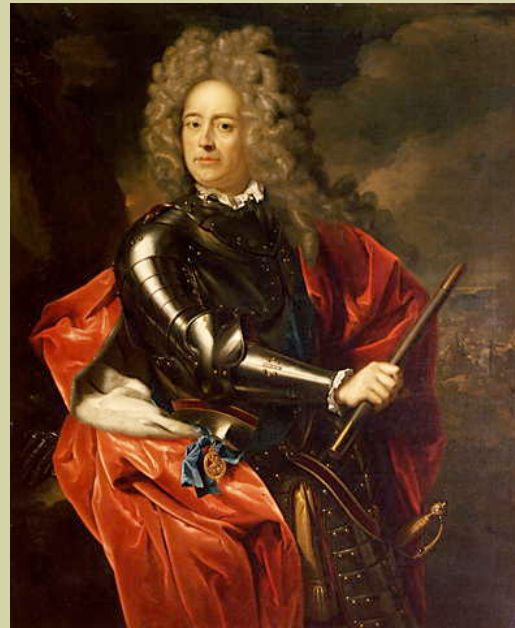
John Churchill, 1st Duke of Marlborough painted by Adriaen van der Werff